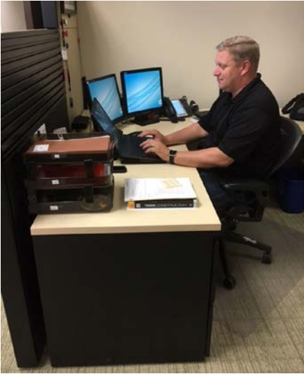
Side views (both, if possible) and include both mousing and typing postures.

Please include photos of the following angles/views. The employee must be included in the photos. If possible, include the height measurements of the desk (top of desk to floor) and the employee's seated elbow height.